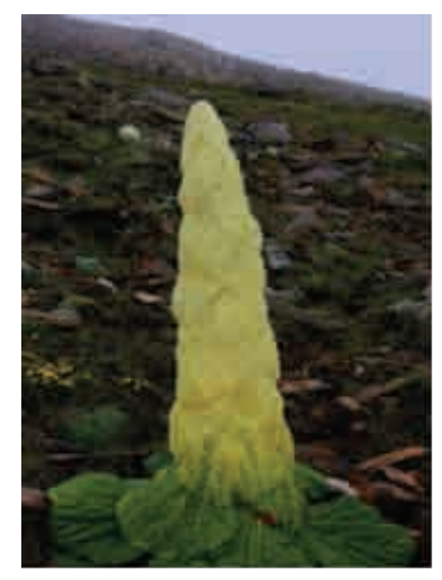
Fig. 5a: Rheum nobile

Fig. 5: The study has found range extension for plant species such as