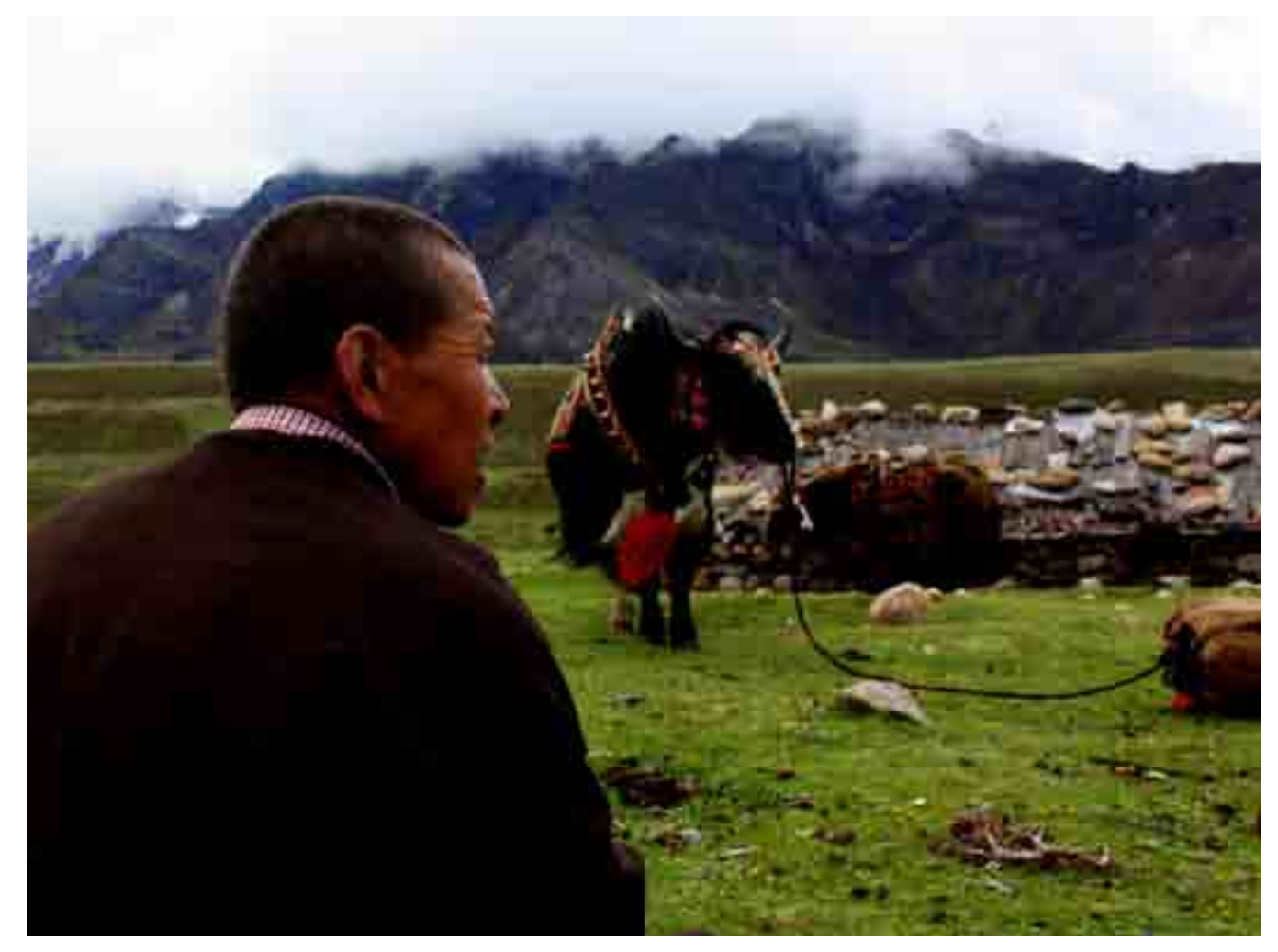
Indigenous people have a wealth of knowledge based on their observations on the obvious links between climate change and biodiversity