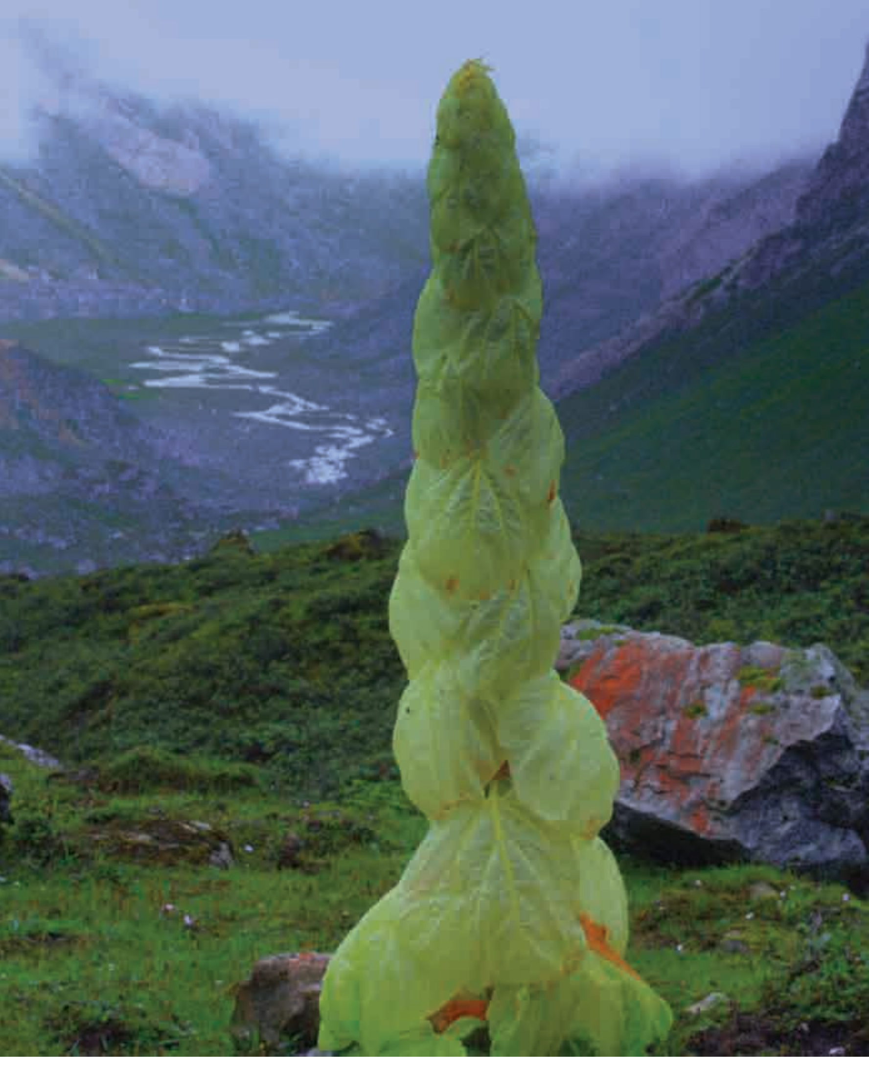
Rheum nobile is among the many high altitude species threatened by climate change