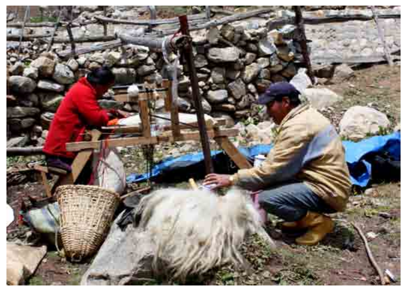
Fig. 1c: Woman weaving yak fur carpets and man preparing yak tail for sale to tourists