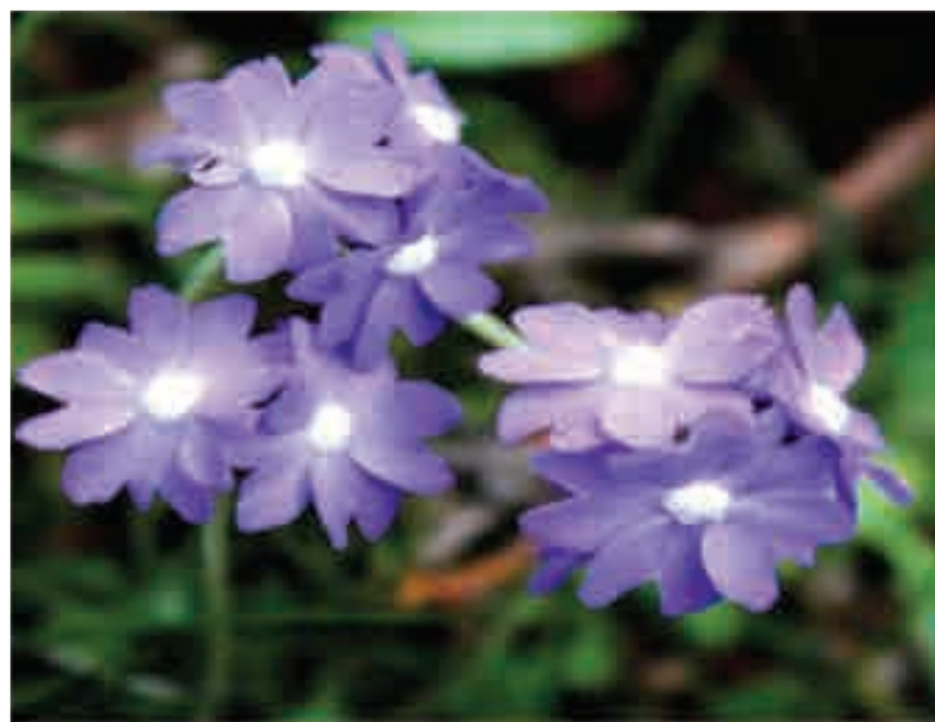
Fig. 5d: Primula primulina