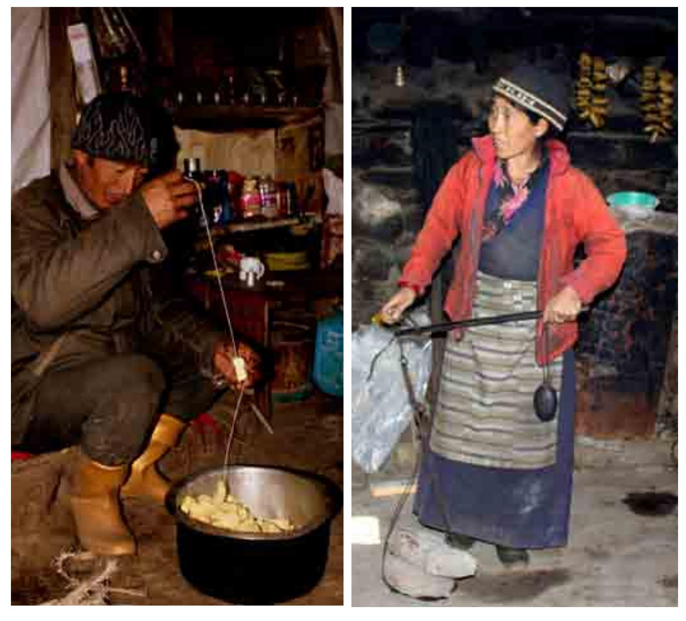
Fig. 1a: Dokpa making hard cheese for sale, Lachen Valley