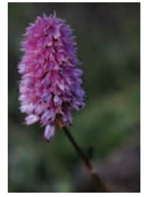
Fig. 5c: Bistorta sp.