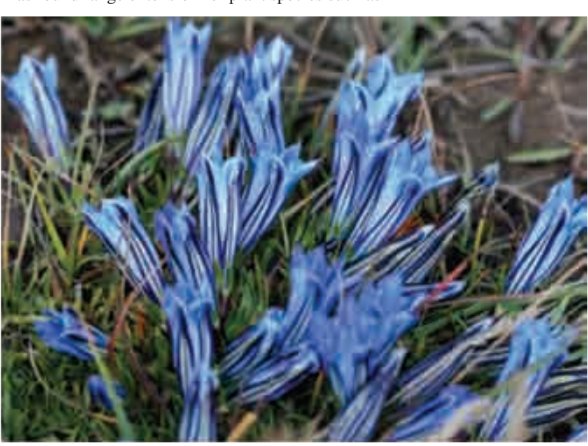
Fig. 5b: Gentiana sino-ornata