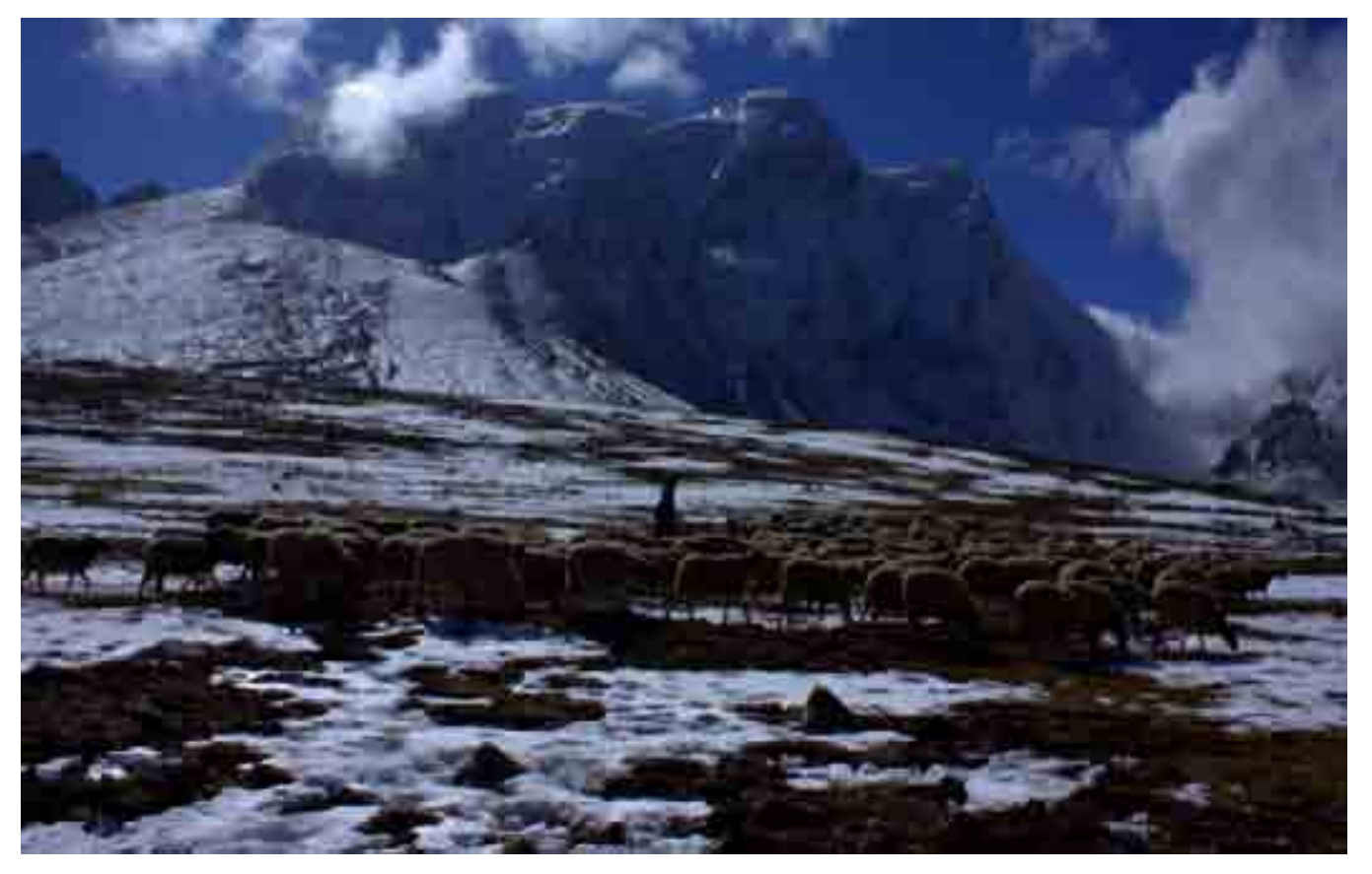
Fig. 3: Sheep grazing in the winter grazing pastures above 5000 meters in North Sikkim

Furthermore, Lachenpas and Dokpas still maintain their indigenous political institution, the Dzumsa, which primarily manages the patterns of utilization of natural resources (Bourdet-Sabatier 2004). When the panchayat system was introduced into Sikkim in the 1970's it was not imposed upon the two valleys of Lachen and Lachung. Eventually the Dzumsa was officially recognized by the government of India in 1985. The Dzumsa is an annually elected body of 12 village representatives. It is composed of 2 pipons (or Headmen), 6 gembos (assiatants to the pipons/ executive), 2 Tsipos (accountants) and 2 Gyapons (messengers). This body represents the people of Lachen and manages resource utilization and conservation, pasture management for grazing, conflict resolution, social and community mobilization, and traditional and local governance. Over the years this institution has enabled the community a certain degree of resilience by adapting to the numerous changes in their socio-ecological systems due to social, economic and political transformations (Bourdet-Sabatier 2004), and most recently due to the cascading effects of climate change. In harsh conditions like the alpine Himalayas, social systems, or institutions like the Dzumsa play a vital role by regulating resource use in a way that prohibits over use and provides social, economic, and environmental security to the people.