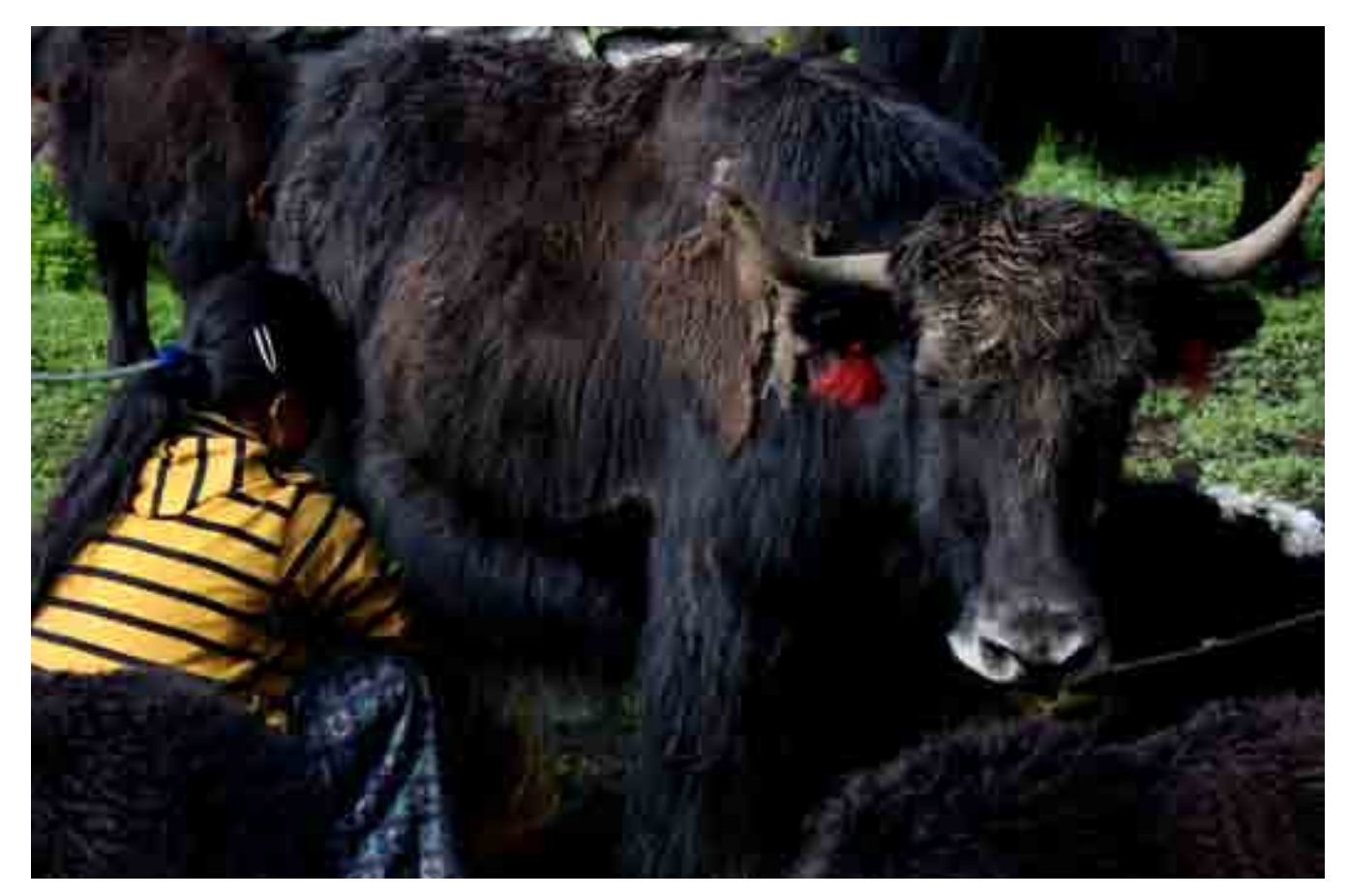
Fig. 2: Livestock such as the yak play an indispensable role for the livelihoods of the Dokpas